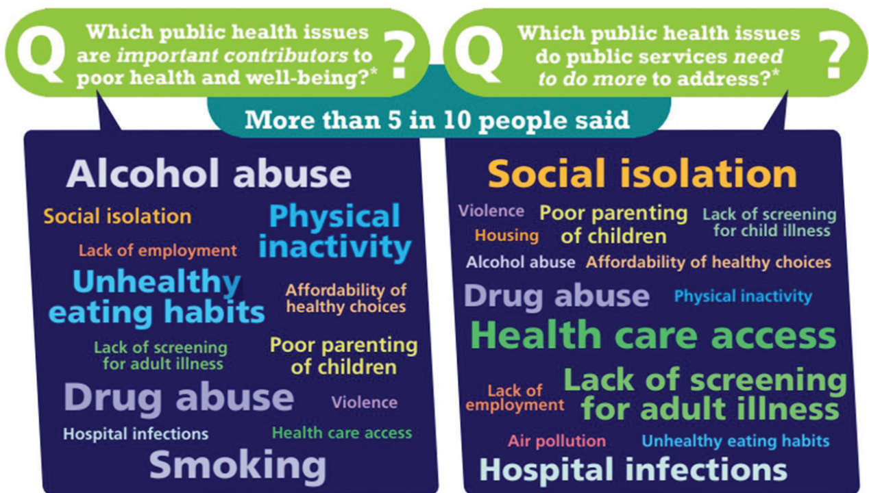
Figure 2: Key health issues in Wales

The top five perceived contributors to poor health and well-being were smoking (1st), drug abuse (2nd), alcohol misuse (3rd), physical inactivity (4th) and unhealthy eating habits (5th). These issues were in the top five for both males and females, with females more commonly identifying each issue as important. Social isolation and loneliness and problems due to poor parenting of children were ranked sixth and seventh, respectively. (Fig 2)